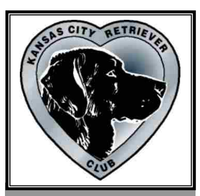
January , 2006 Volume 9, Issue 1